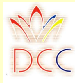
Dutch Chamber of Commerce Macedonia Kosovo

We were received in a very professional and warm way and he showed us that this cooling and heating systems could also be used for offices, hotels and private housing. He currently offers his energy to the surrounding community.