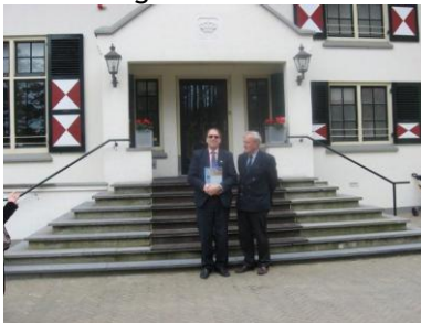
Royal Golf Club Wassenaar