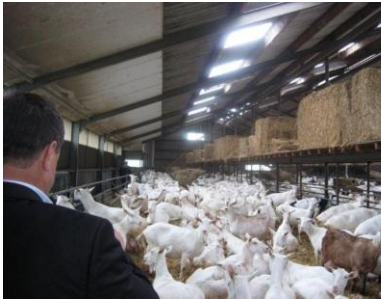
Goat farm Friesland