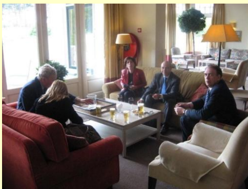
Meeting with Macedonian and Albanian Ambassadors at the Royal Golf Club