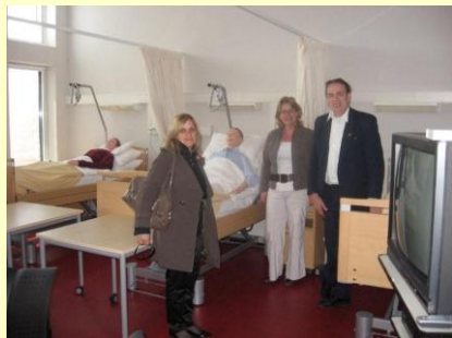
Nurse school at Saxion