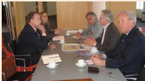
Meeting at Chamber of commerce Rotterdam

We soon will update you about our next mission the 2 days of Kosovo and Macedonia Albania match making and open day in The Netherlands.