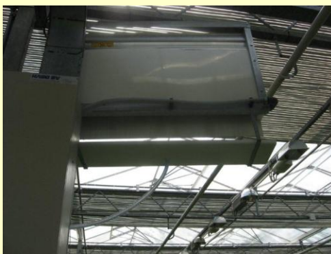
Cooling unit greenhouse