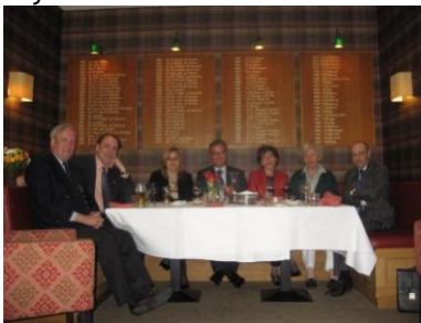
Diplomatic meeting at the Golf club